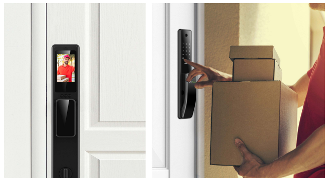
Real-time monitoring from the indoor