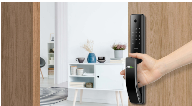
Automatic locking and unlocking after verification